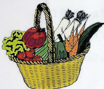
Share your harvest.

Westbrook Food Pantry is located in the Westbrook Community Center